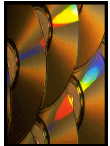
Future Growth of NSCF

While our nation is still at risk with regard to our children's performance in the sciences and mathematics, the Foundation firmly believes that to harness technology in a fashion consistent with legitimate learning techniques, we can help catapult our students into a vastly improved environment for success in these areas of educational studies.