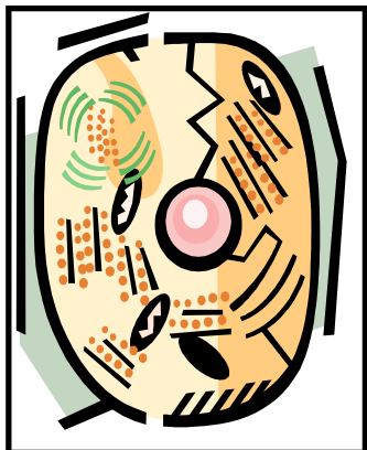
ESOL End-of-Course Biology Review